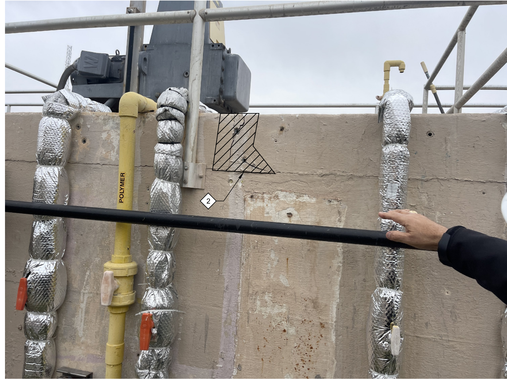
10 PHOTO 00S01 SCALE: NO SCALE FILE: