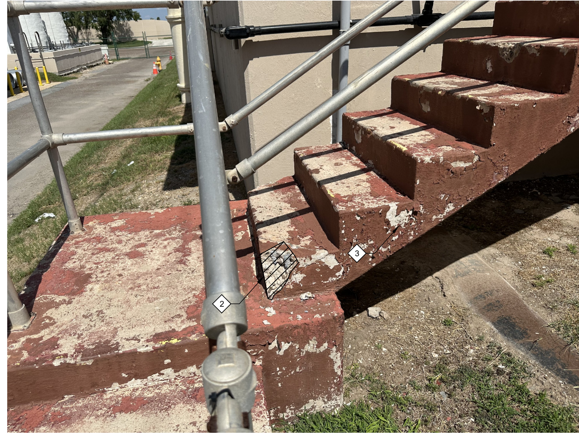
11 PHOTO 00S01 SCALE: NO SCALE FILE: