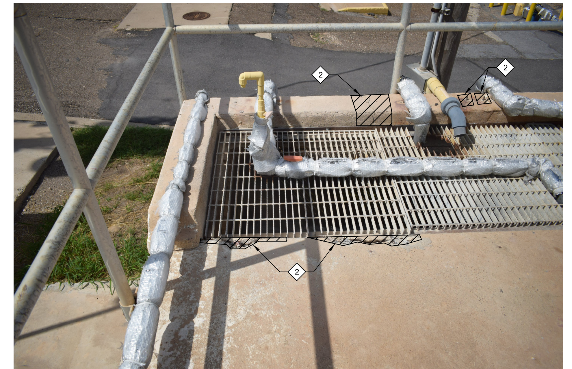
9 PHOTO 00S01 SCALE: NO SCALE FILE: