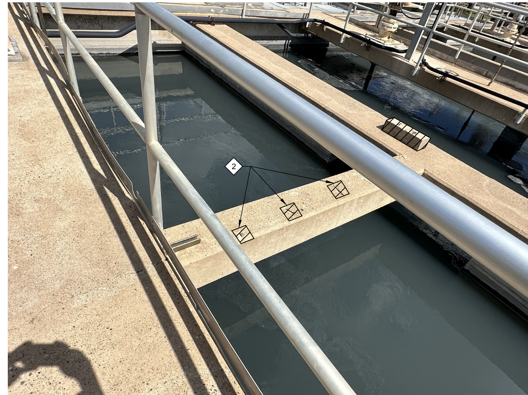
8 PHOTO 00S01 SCALE: NO SCALE FILE: