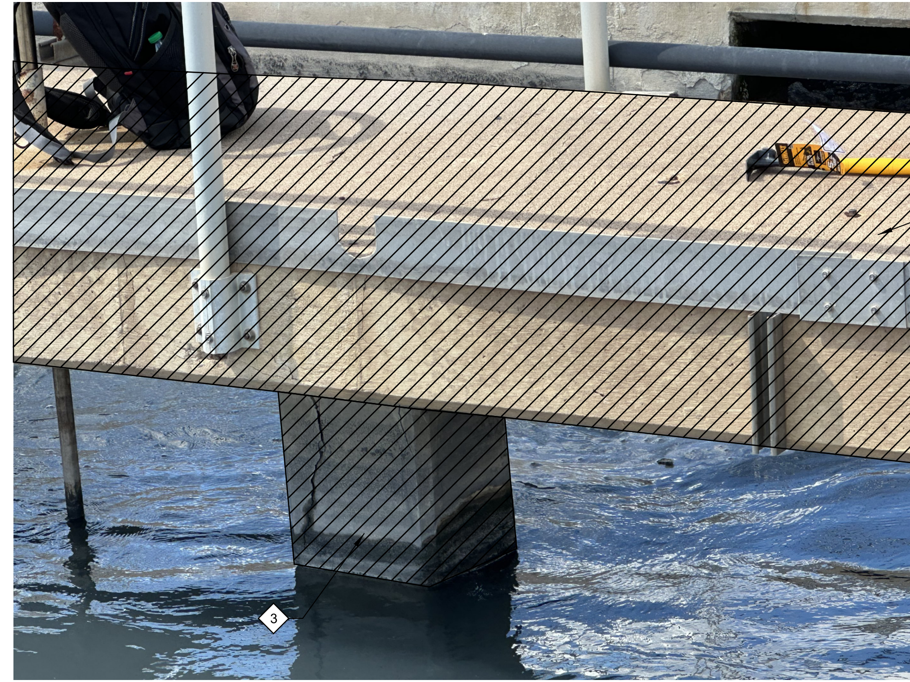
6 PHOTO 00S01 SCALE: NO SCALE FILE: