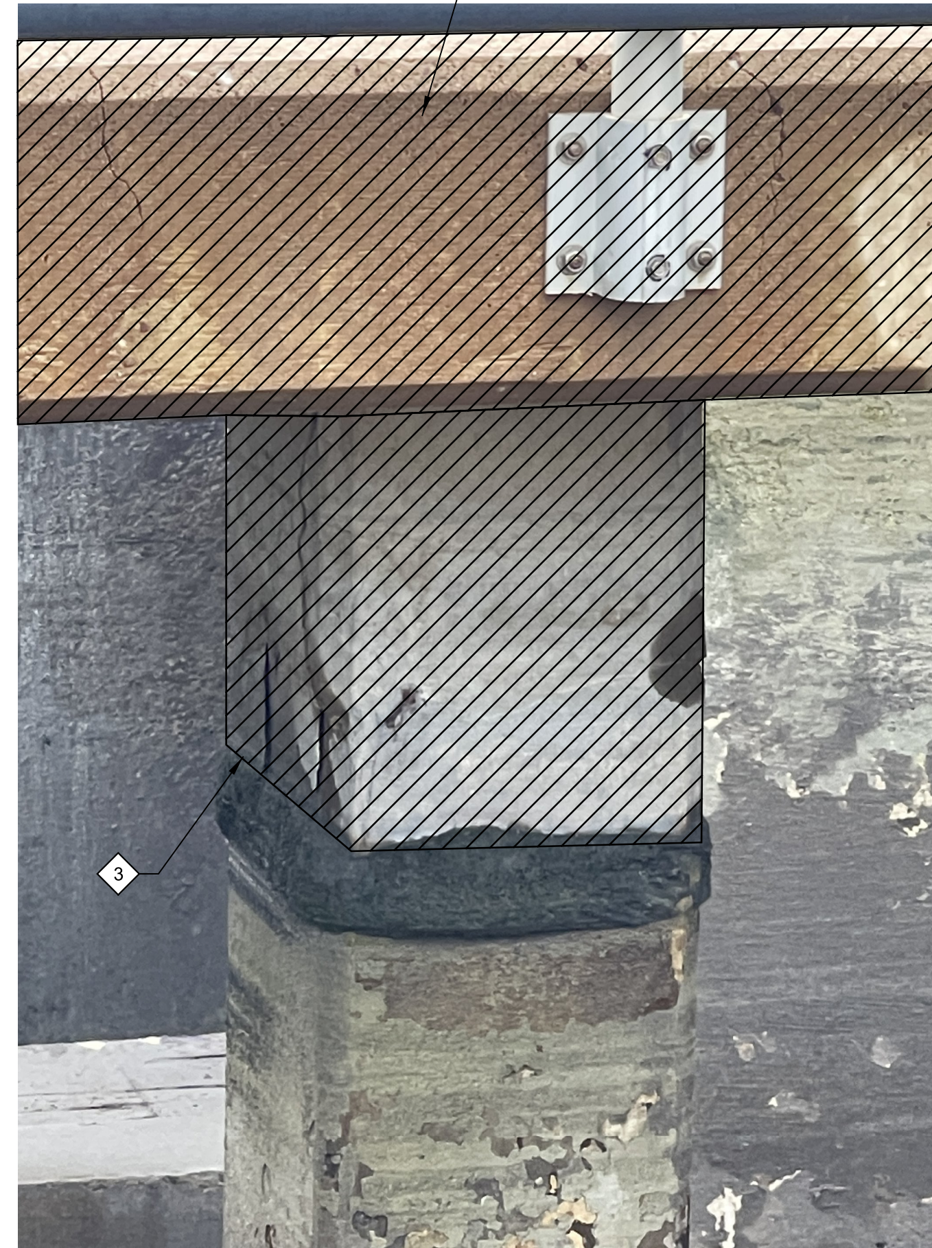
7 PHOTO 00S01 SCALE: NO SCALE FILE: